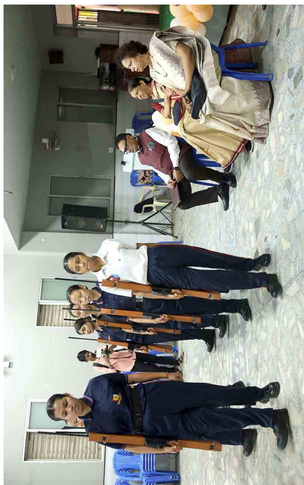
Senior Girls' NCC Unit at S.D. Jain Girls College