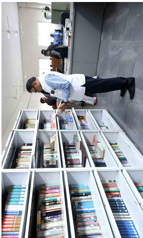
A peep inside the Library and Reading Room