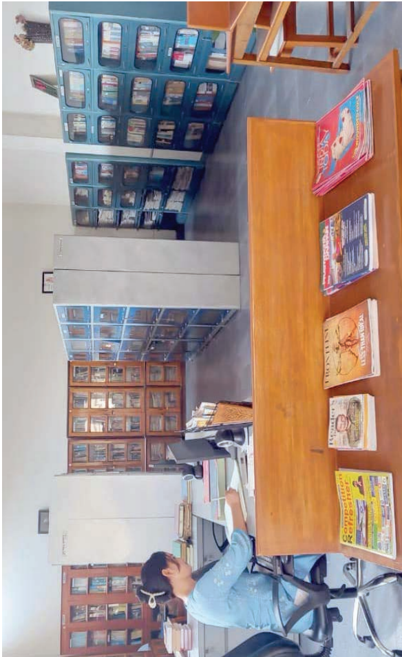
A peep inside the Library and Reading Room