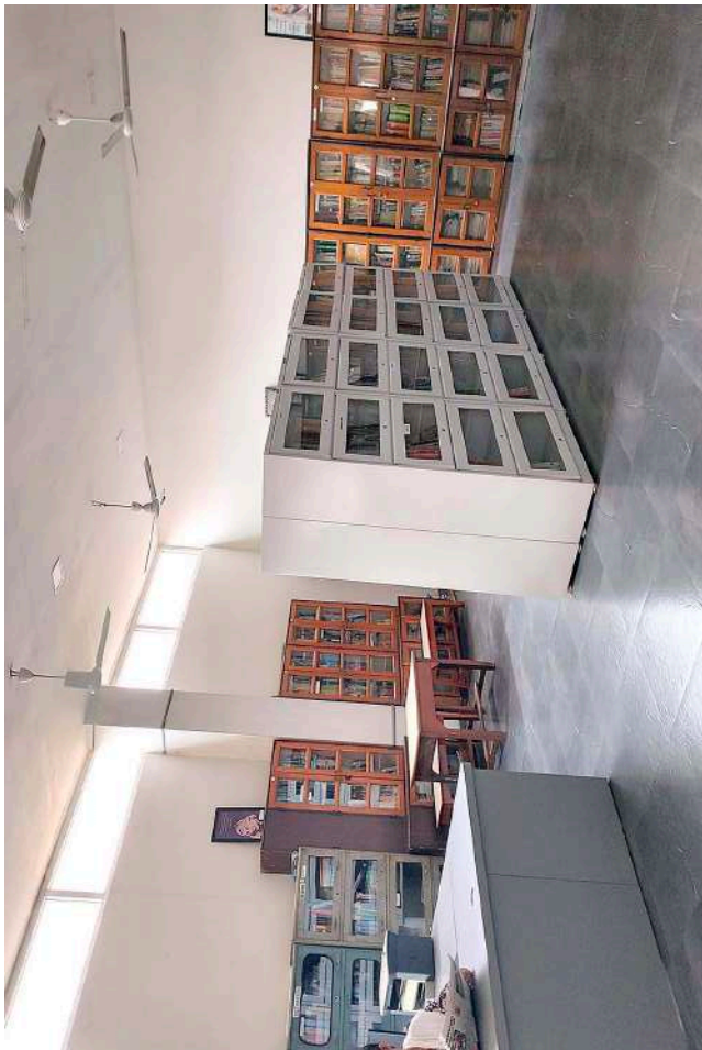
A peep inside the Library and Reading Room