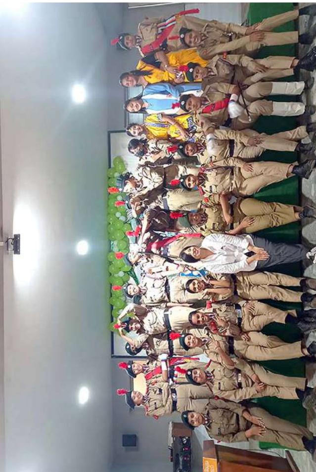
Senior Girls' NCC Unit at S.D. Jain Girls College